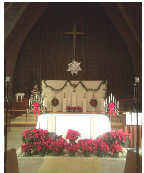
All Saints Altar Christmas 2010

All Saints continues to recycle paper and plastic products as well as cell phones and printer cartridges as part of our efforts to help our fragile environment. The cell phone and printer cartridge recycling box is in the foyer of the Mission House. Please, consider this important ministry of the Parish. Many thanks!