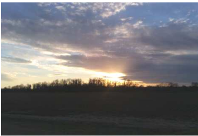
The Mississippi Delta near my family home 02.06.11

As you will see throughout this Epistle, there are many things going on at All Saints. We continue to move forward and shine the light of Christ to those in Stoneham, Reading, Wakefield and beyond. You are that light, and I am very grateful for your continued commitment to God and the ministry we share at All Saints.