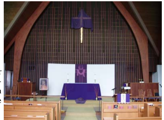
Altar at All Saints, Lent 2010